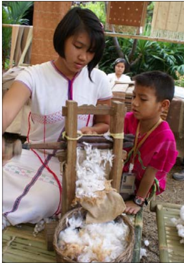
Two of the students at Doi Tao Karen weaving group de-seed home grown cotton on a gin before spinning