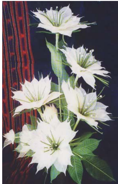
Give Valentines' Day Flowers with added meaning: it enables villagers in Songkhla, in the South to earn a decent living. And the blooms last longer, too!

Let us celebrate the Valentines Day message of love and caring for others as well as the promise of a new political beginning by making ourselves more conscious about the way we can use our power in shopping. The ThaiCraft Fair gives us the opportunity to adopt a Fair Trade mindset — a "Yes we can" mentality that gives the world the message of new hope and love.